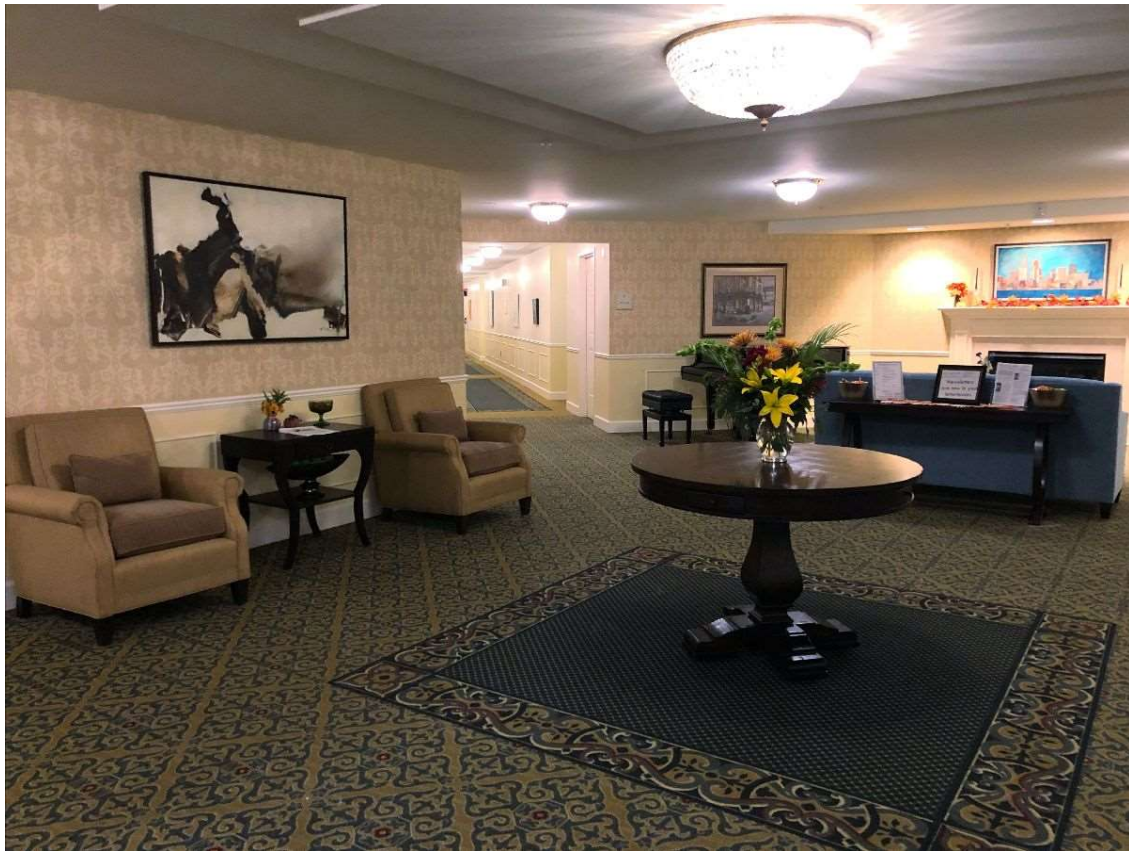
Now on View: Landscape No. 44 , Chuang Che, 1973.

We are thrilled to share that the Gifts of Art fund has received a generous donation from an anonymous donor to support the purchase of several new works of art for the corridor connecting the Meadows to the Manor on the first floor (Corner Cafe corridor).