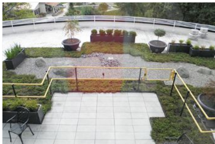
Zen Garden view of the garden from the 4th floor.